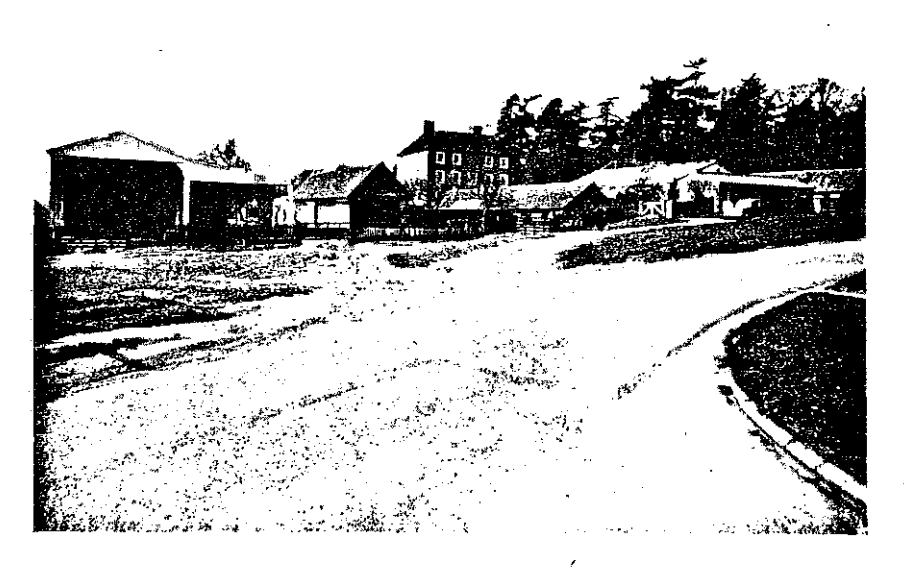
A GENERAL VIEW OF THE BUILDINGS AND HOUSE